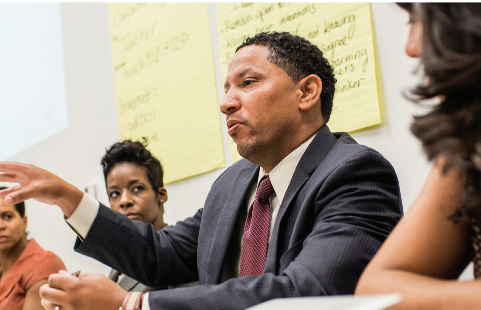
EXHIBIT 3.1 DIAGNOSING TEAMING CULTURE

In our work with principals, we have identified several key areas for teaming culture diagnosis: